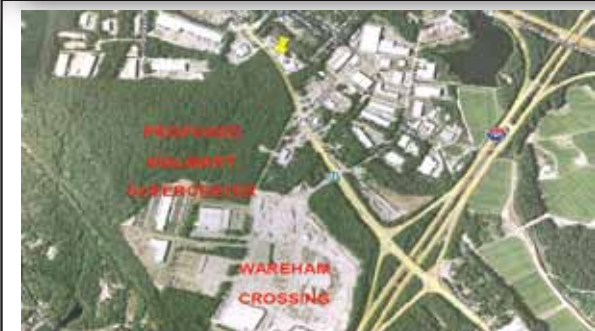
WEST WAREHAM - RT 28 Retail Land - 3.5ac - Prime Loc $4,000,000

Office, Retail and Industrial Investment Properties For Sale