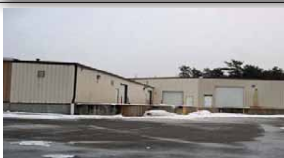
PLYMOUTH Industrial - Warehouse 41,500 SF - $1,700,000