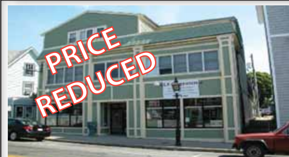
ONSET - ONSET AVENUE Investment Property - 3 Buildings 20 Units - $2,145,000