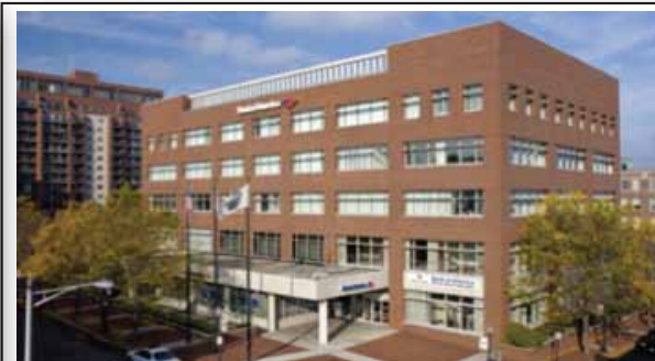
NEW BEDFORD - BANK PLAZA Professional Office Building New Price- $ 7,200,000

Specializing in Commercial Real Estate for Southeastern Massachusetts and Cape Cod