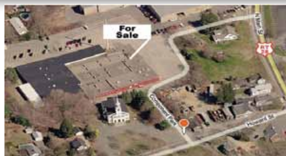
WEST BRIDGEWATER - RT 28 62k SF Manufacturing/10k SF Office $1,800,000