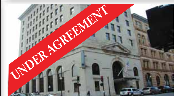
NEW BEDFORD - UNION ST. Sale with Bank Lease Back $1,495,000